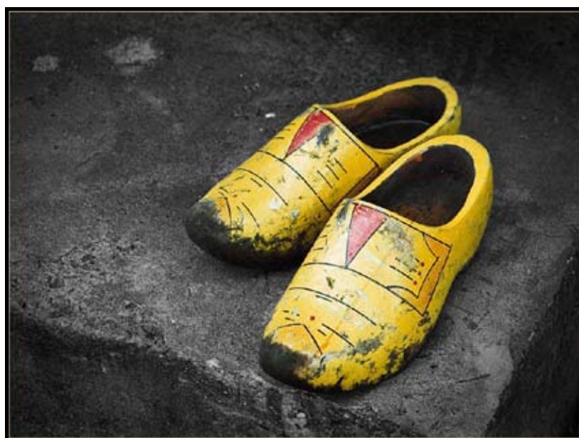
Sandy Parker (Digital) "Wooden Shoes"