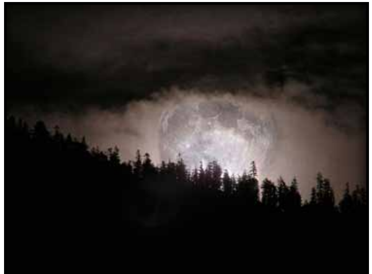
Harvest Moon by Linda Candilas