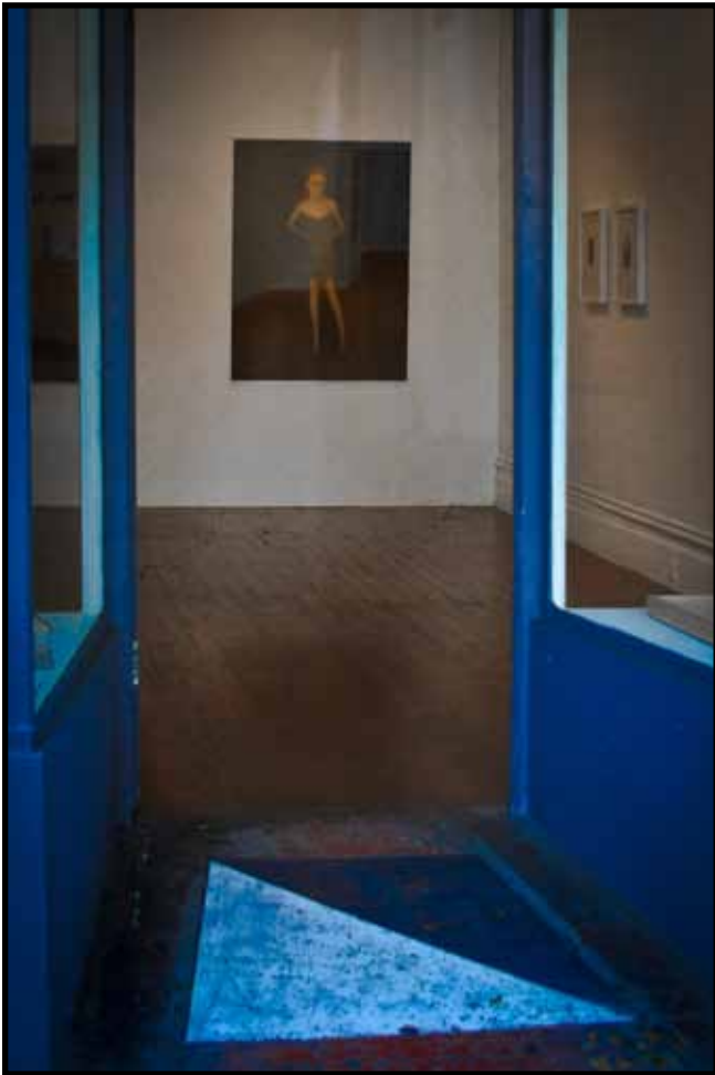
Entrance to Art by Jan Lightfoot