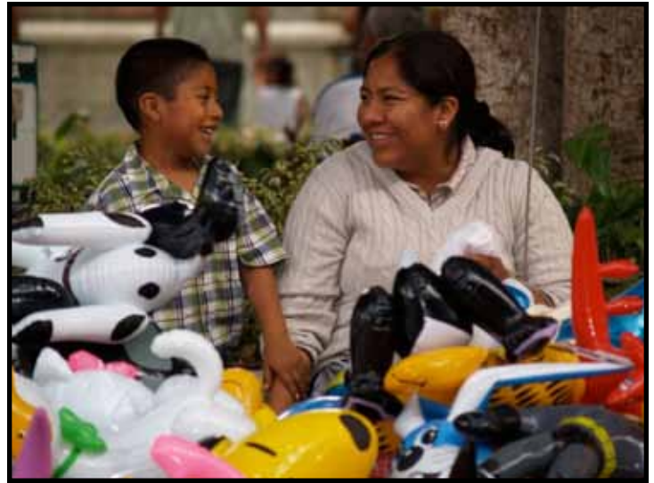
Mother and Child by Theo Goodwin