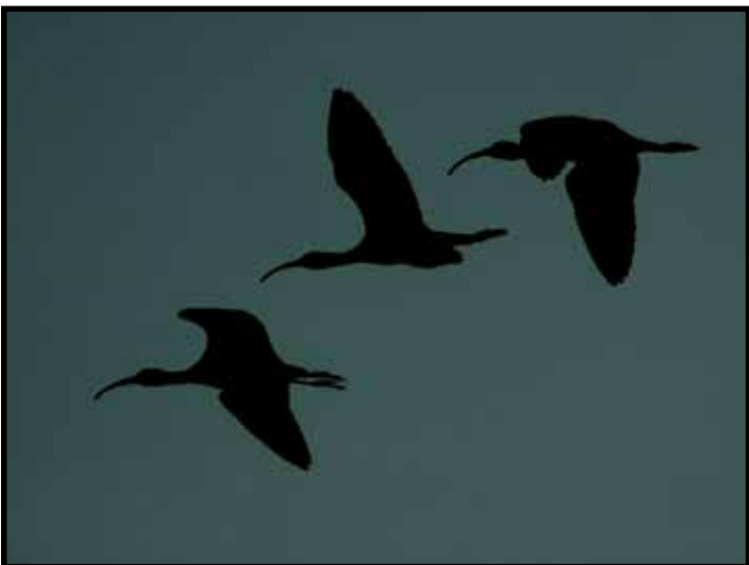
White Faced Ibises in Formation by Donna Sturla