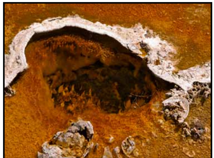
Geothermal Pool, Yellowstone