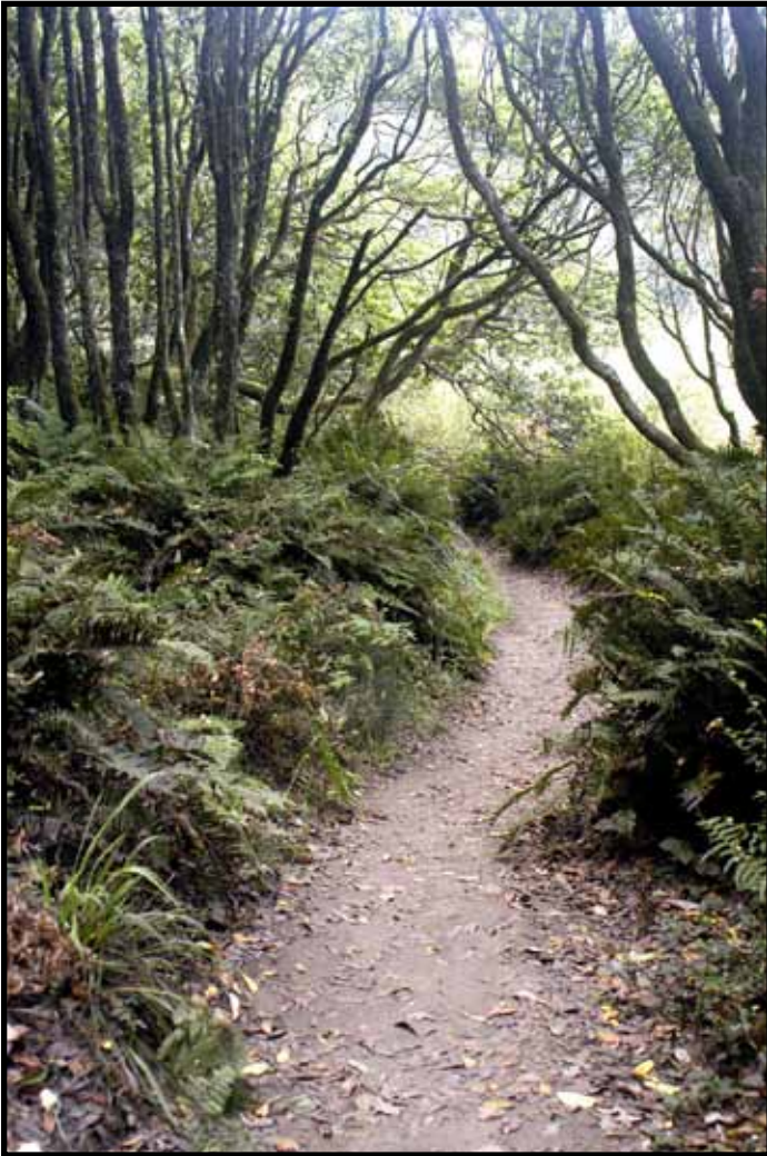
Trail to the Meadow by Allan Trimble