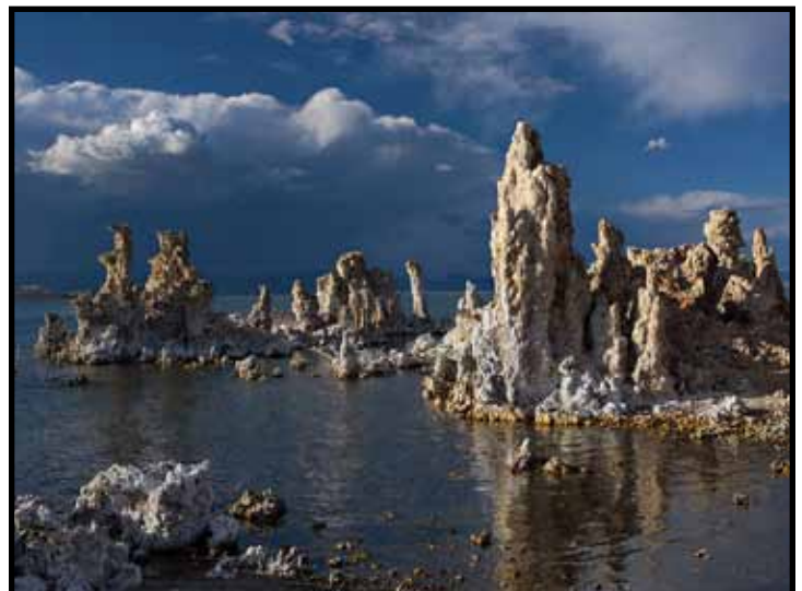
Approaching Storm at Mono Lake by Julius Kovatch