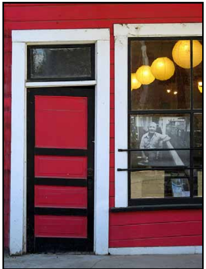
Out of Square, Locke by Alfred Judd