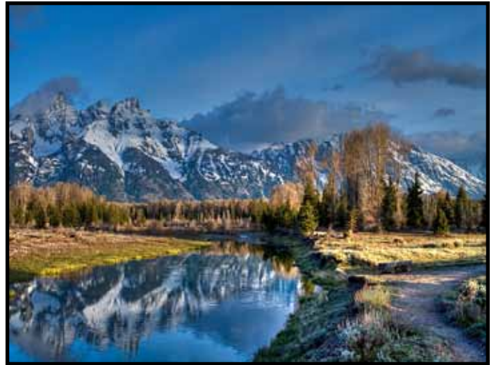
“Grand Tetons”