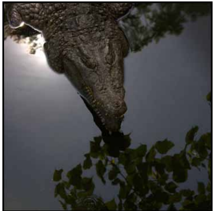
“Crocodile”