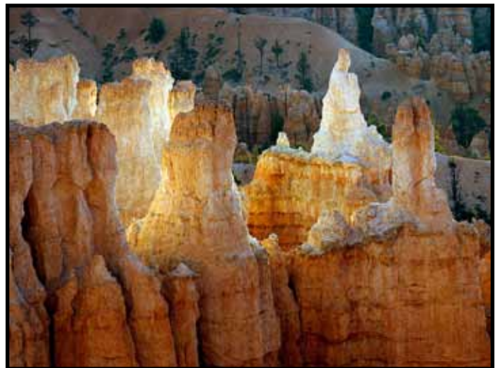
“Bryce Canyon Morning Glow” by Julius Kovatch