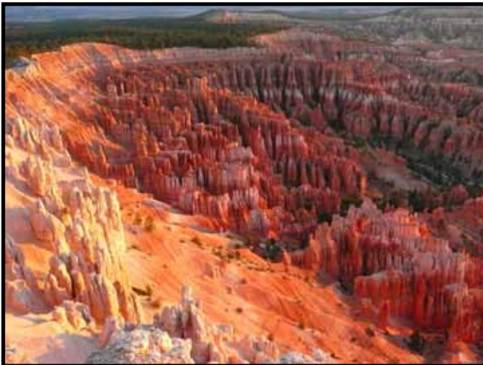
“Bryce Canyon Sunrise” by Valarie Trudeau