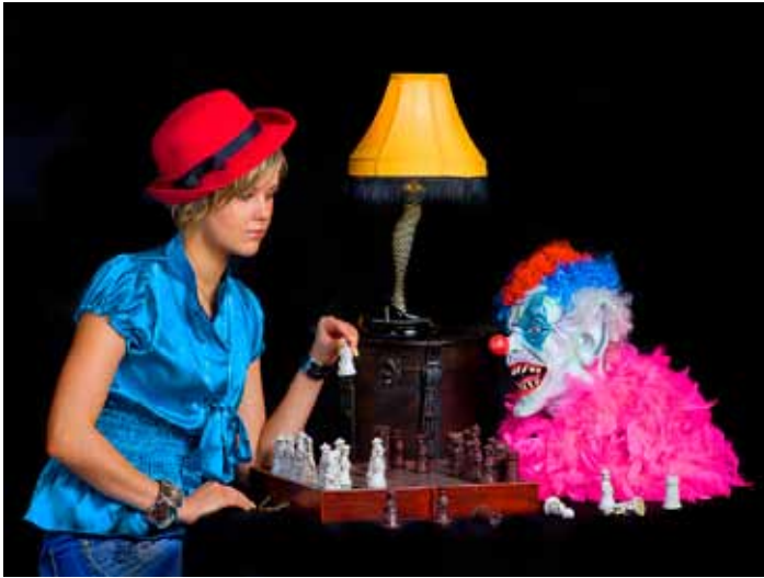
“Your Move” by Truman Holtzclaw