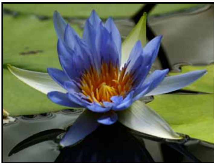
"Blue Water Lily" by Jeanne Snyder