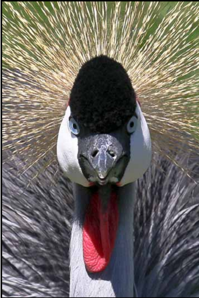
“Crowned Crane” by Jan Lightfoot