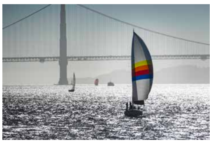
"Sailing by the Golden Gate Bridge" by Hayata Takeshita