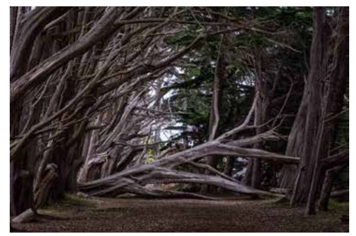
"Fallen Cedar, Moss Beach Grove" by Theo Goodwin