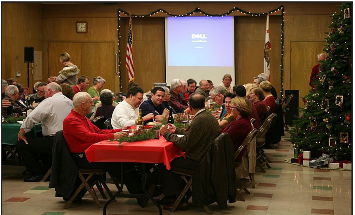
A happy gathering of Sierra Camera Club for our Christmas Potluck Dinner.

For help formatting your images see the attachment with this newsletter.