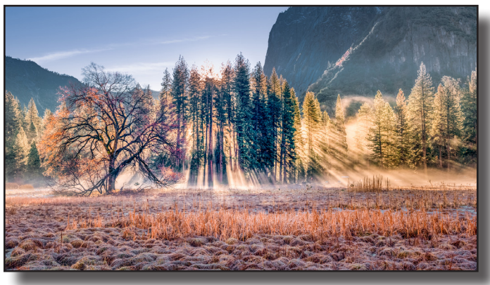
"Morning In Yosemite" by Hayata Takeshita