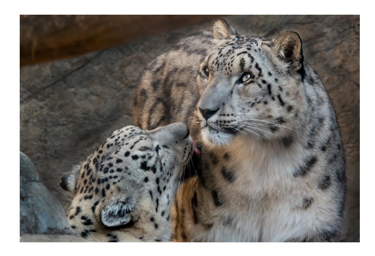
"Snow Leopard Grooming His Mom"