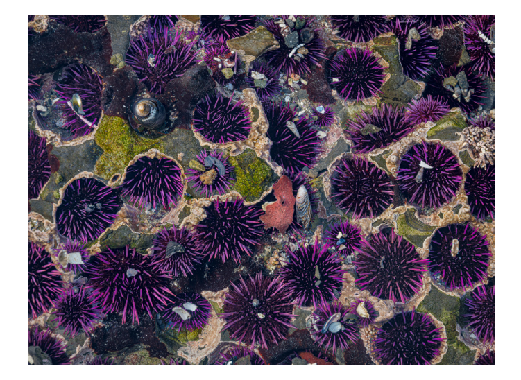
"Tide Pool I, Pacific Purple Sea Urchins by Bob Adler