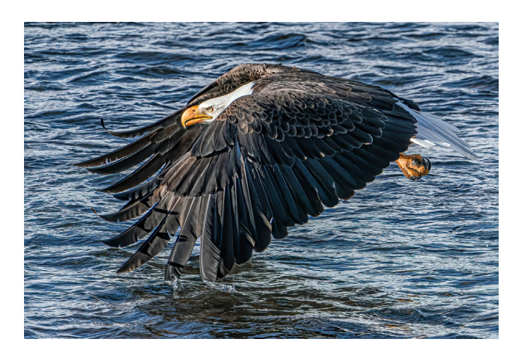
"Bald Eagle Dipping Wing" by Don Goldman