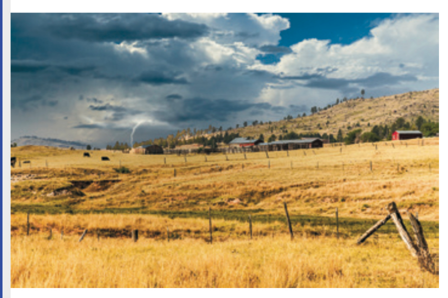
Approaching Storm by Kurtis Sutley Group 38 General

Study groups are small groups of photographers, from all experience levels (beginner to pro), who share an interest in a particular type of photography, such as nature, monochrome, macro, etc.