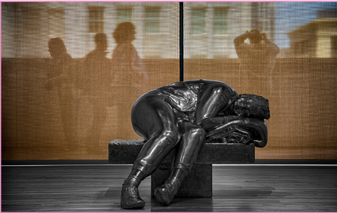
3rd Gary Cawood "Nap Time @ SF MOMA"