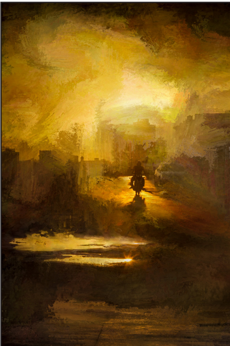
2nd Jan Lightfoot---The Good Ride