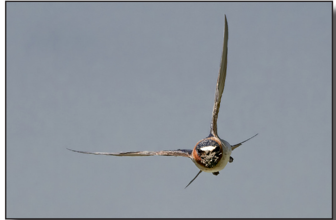
HM Jan Lightfoot “Barn Swallow in Flight With Mud”