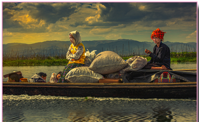
HM Goldman "Life on Inle Lake Myanmar"