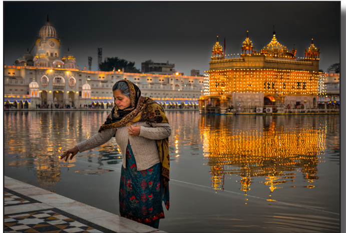
HM Don Goldman”Evening at Golden Temple Amritsar India”