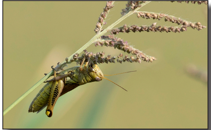
2nd Bice “Differential Grasshopper”