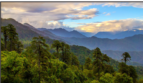
HM Gary Cawood "View at Dochula Pass Summit Bhutan"