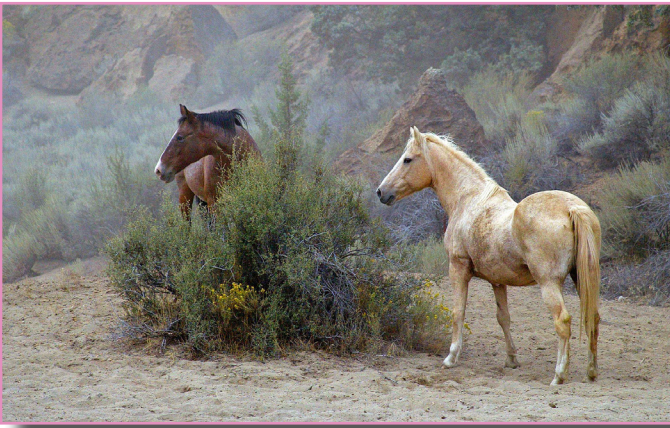
1st Julius Kovatch "Horses at Rest"