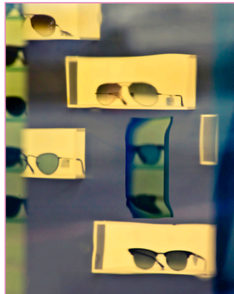
HM Joe Finkleman "Straight Photo 2"