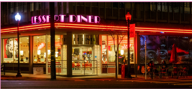
HM Gary Cawood "Rick's Dessert Diner"