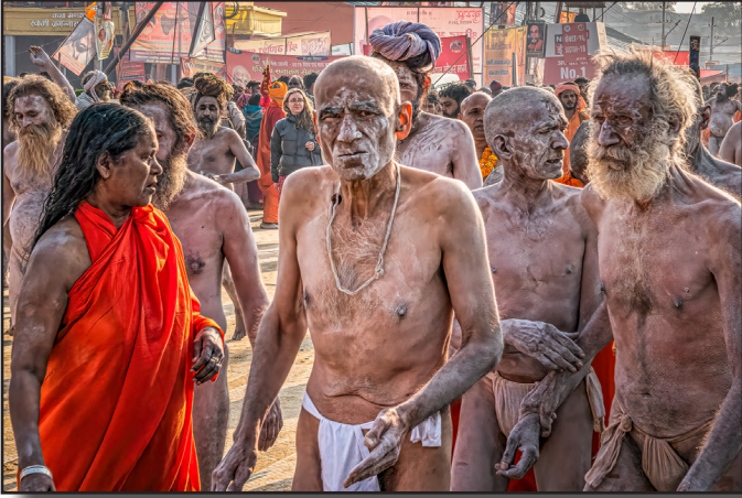
1st Don Goldman “Sadhu Holy Men at Kumbh Mela Festival Allahabad India”