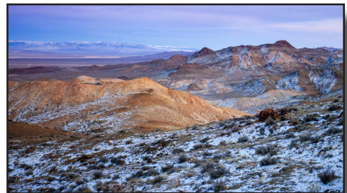
HM Jan Lightfoot "Dusting of Snow at Sunset"