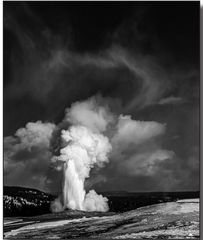
2nd Pat Honeycutt "Old Faithful"