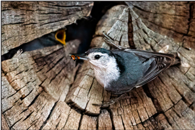
HM Jan Lightfoot “Female Nuthatch Feeding the Kids”