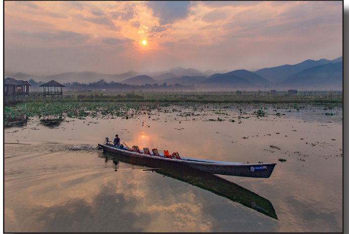
2nd Gary Cawood “Sunset at Lake Inle, Myanmar”