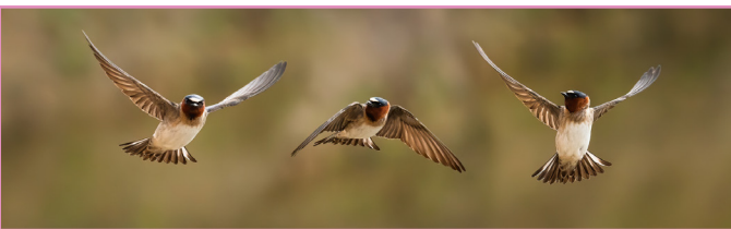
HM Jan Lightfoot "Six Inches Apart"