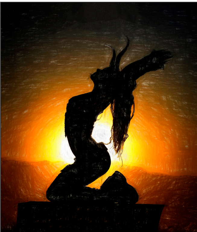
"Soul Searching" By Truman Holtzclaw