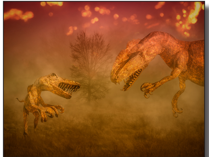
"Near the End" By Don Goldman