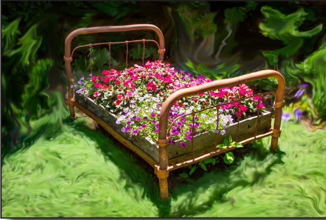
"Flowerbed in Dreamland" By Gert van Ommering