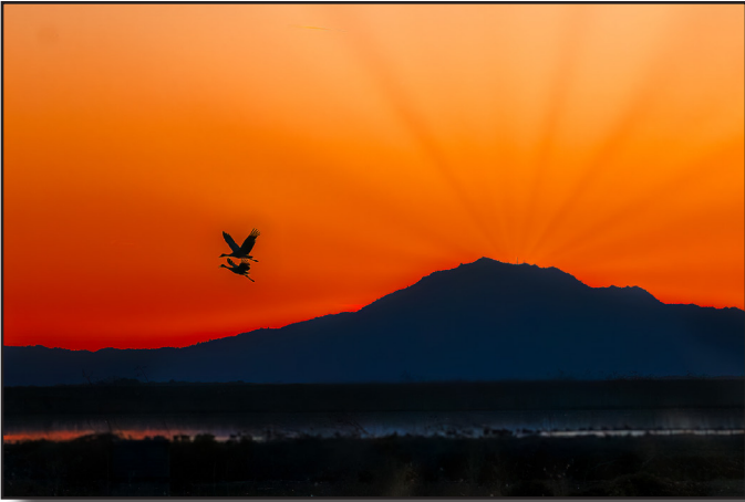
“Sunset Flight Sand Hill Cranes” By Lucille van Ommering