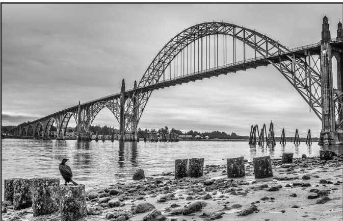
“Newport Oregon Bridge” By Pat Honeycutt