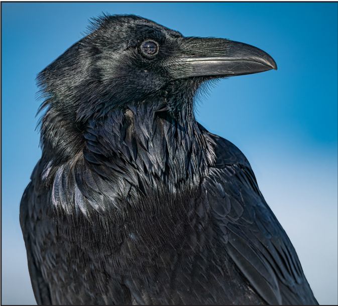
“Raven” By Don Goldman