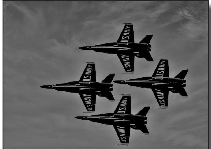
“Blue Angels Flying High” By Laura Berard