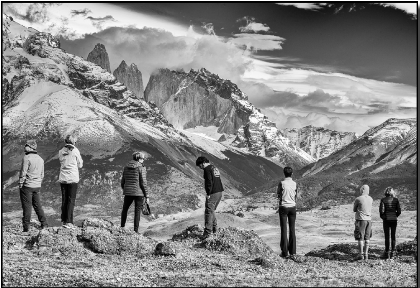
Travel Image of the Night November 2020 Patagonia Moment to Remember by Pat Honeycutt

Volume 84 Number 12 * December 2020 * www.sierracameraclubsac.com