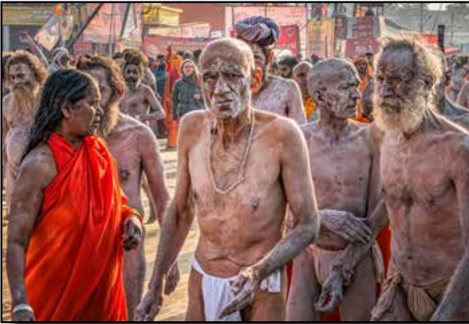
“Sadhu Holy Men at Kumbh Mela Festival Allahabad India”