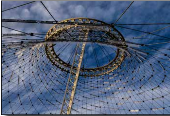
“Sculpture in Centennial Park Spokane, WA”