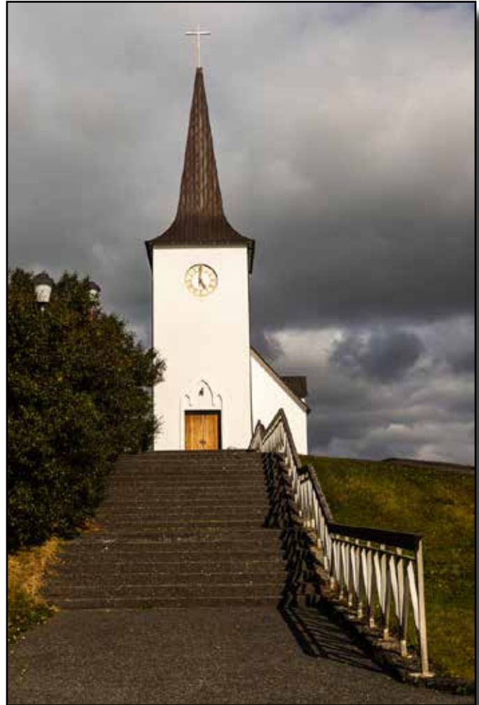
“Borgarneskirkja Iceland”