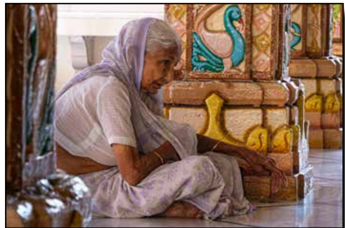
“Elderly Hindu Woman Praying Amedabad, India” by Theo Goodwin