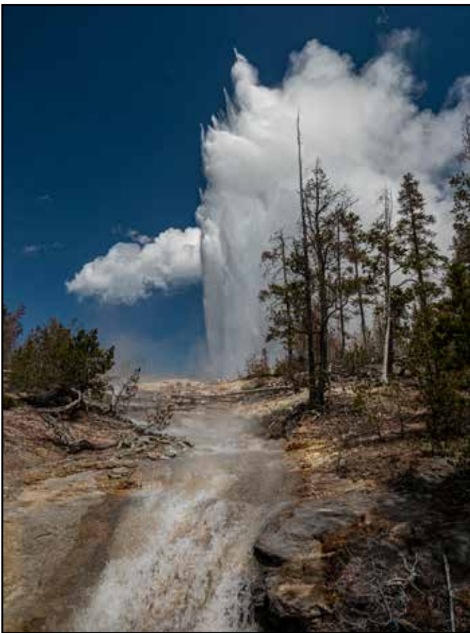
“Steamboat Geyser Erupting, Yellowstone NP”