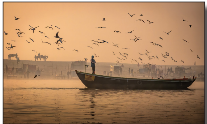
“Ganges Sunrise, Awaiting Customers” By Don Goldman