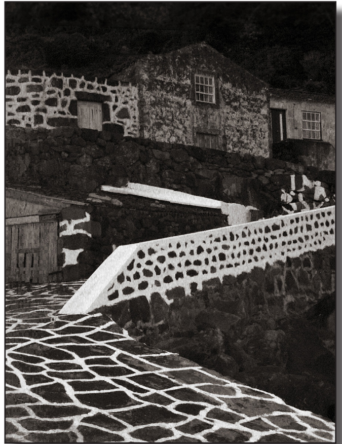
“Azorean Village” By Paulo Oliveira