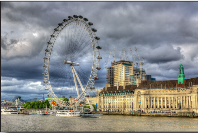
“London Eye”