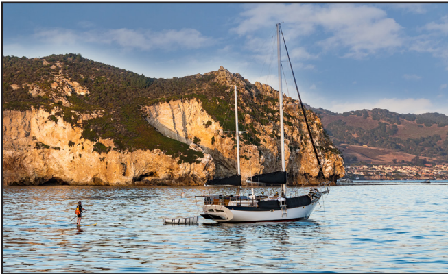
“Paddling Home from Pismo Beach” By Gary Cawood