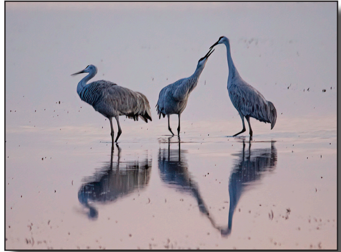
“Loving Cranes at Sunset” by Donna Sturla