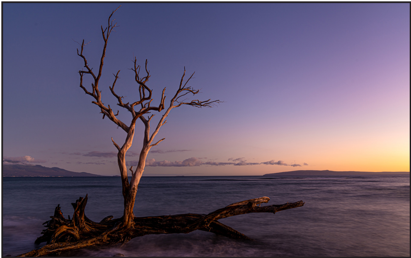
General Image of the Night “Lone Tree at Sunset” by Jan Lightfoot

Volume 83 Number 5 * May 2020 * www.sierracameraclubsac.com