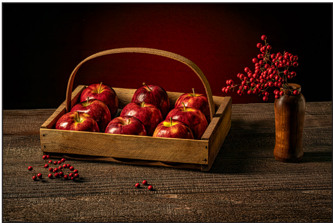
“Apples” by Don Goldman