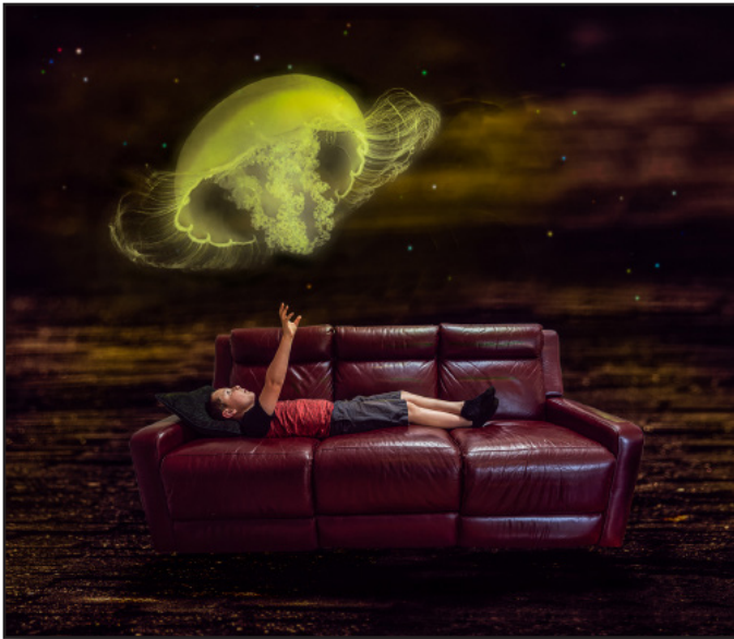
“Childhood Dream” by Don Goldman