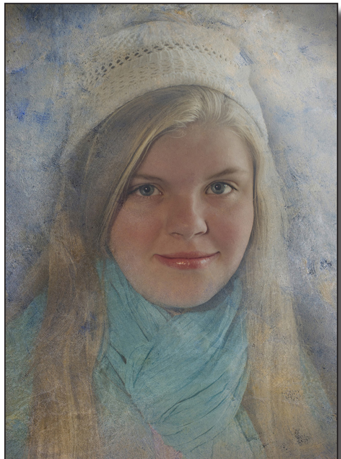
“By Frosted Window Light” by Donna Sturla