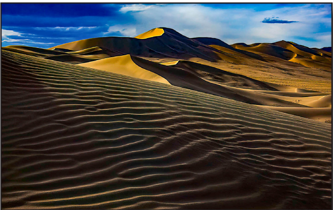
“Eureka Dunes #2 , Death Valley” by Truman Holtzclaw