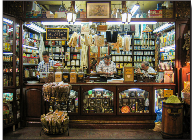
“Turkish Pharmacy Grand Bizarre Istanbul” By Gary Cawood