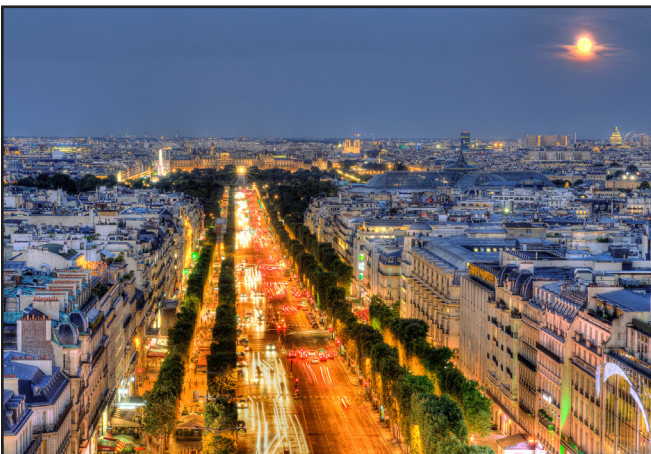
“Champs Elysee and Notre Dame from Arc de Triomphe”