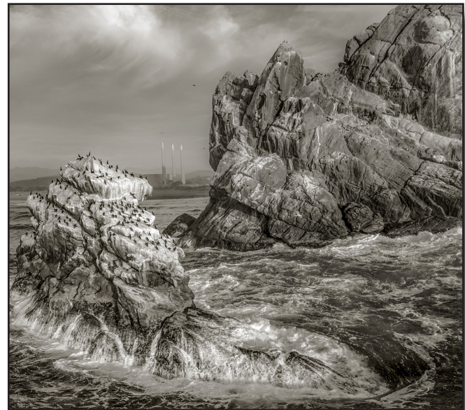
“Morro Bay From the Back at Sunset” By Jason Rath