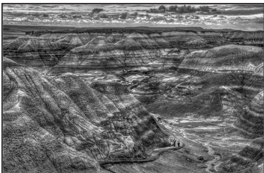
“Blue Mesa Trail Petrified Forest National Park” by Lucille van Ommering