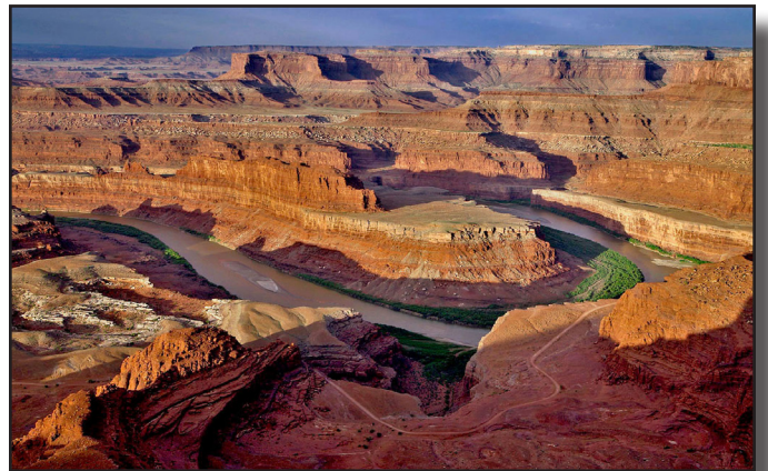
“Dead Horse Point” by Julius Kovatch