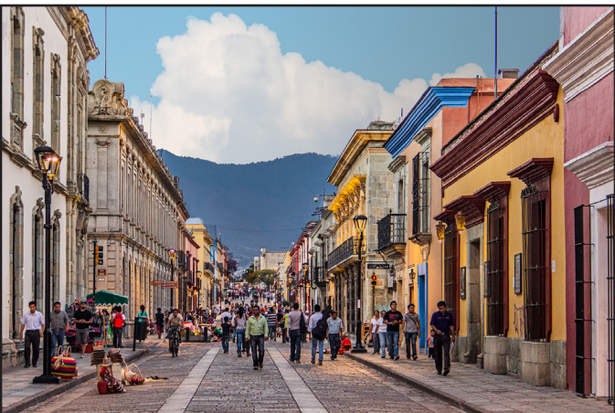
“After the Festival, Oaxaca” by Gary Cawood