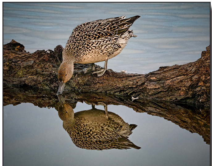
“Female Pintail Reflection” by Don Goldman