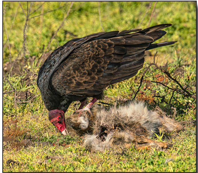
“Turkey Vulture Meal” by Don Goldman