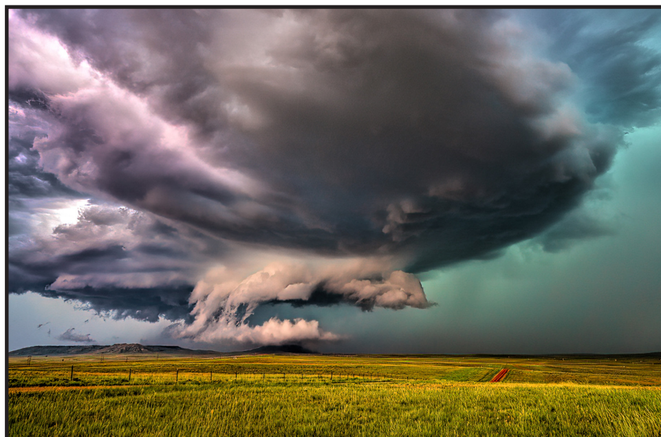
Landscape Image of the Night “Supercell” by Don Goldman