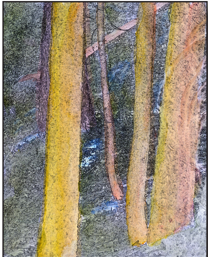
As the children slipped off their blindfolds, they discovered they were no longer at the birthday party but rather, now they were in the forbidden forest.