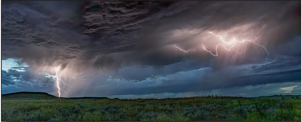
“Double Night Lightning” by Don Goldman