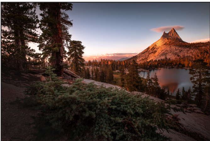
“Upper Cathedral Lake at Sunset” by Matt Estrada