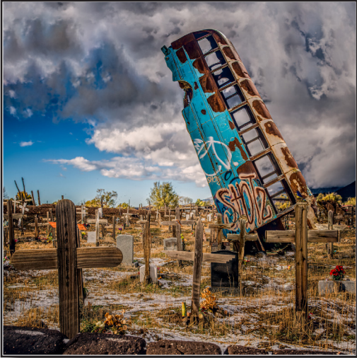
"End of the Line" by Lucille van Ommering