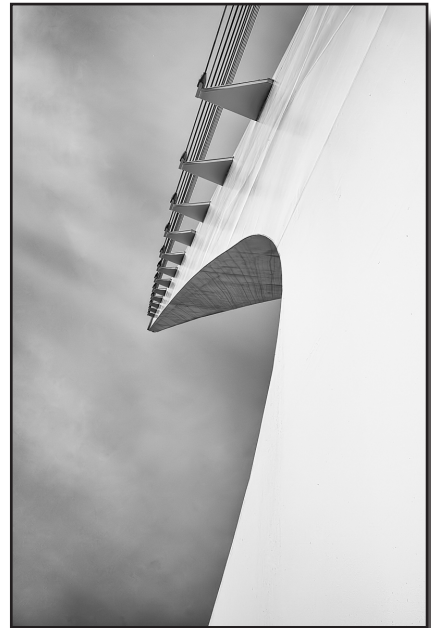
“Sundial Bridge”