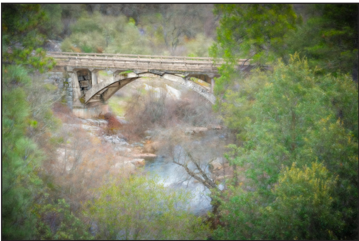
“Old Mount Aukum Bridge Road” by Lucille van Ommering