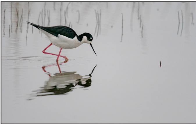
“Black Necked Stilt Goes Hunting” by Gary Cawood