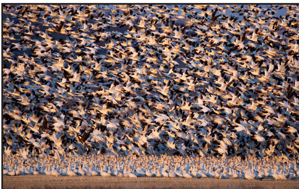
Nature Image of the Night “Snow Geese in Flight and Preflight” by Jan Lightfoot

Volume 84 Number 3 * March 2020 * www.sierracameraclubsac.com