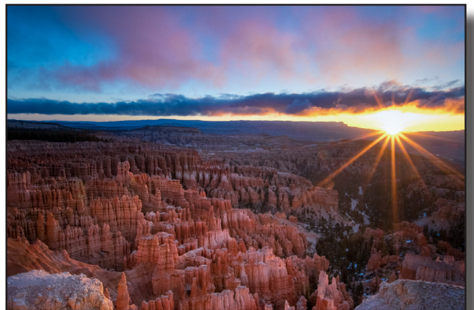
“Sunrise Bryce Canyon Amphitheater at Inspiration Point” by Matt Estrada