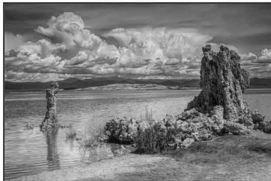
“Mono Lake Hoodoos” by Lucille van Ommering