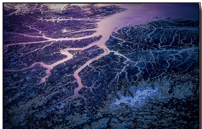
“Cook Inlet AK”