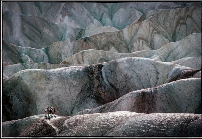
“Zabriskie Pt.”