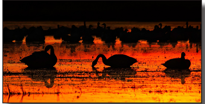
“Tundra Swans at Sunset.”