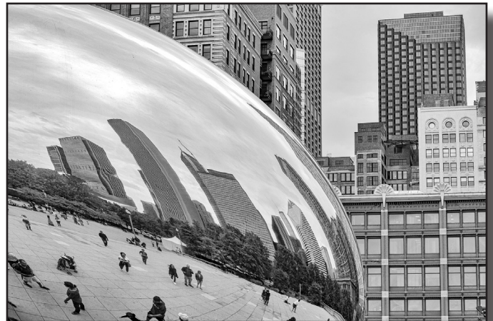
“Cloud Gate Sculpture” by Pat Honeycutt