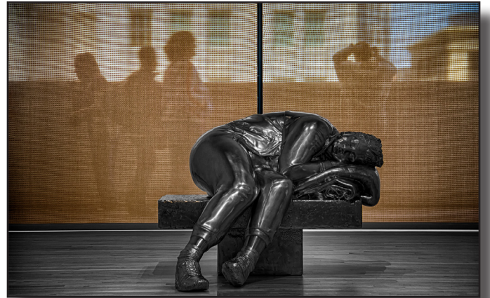
“Nap Time @ SF MOMA” by Gary Cawood