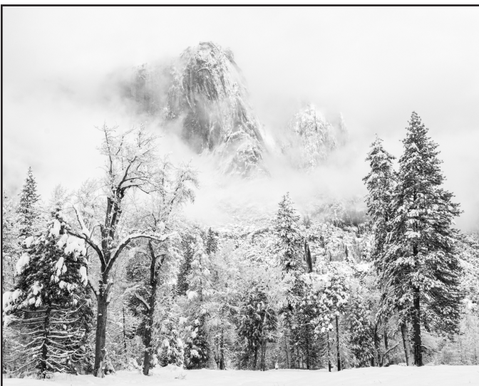
“Emerging Through the Clouds” by Aaron Vizzini