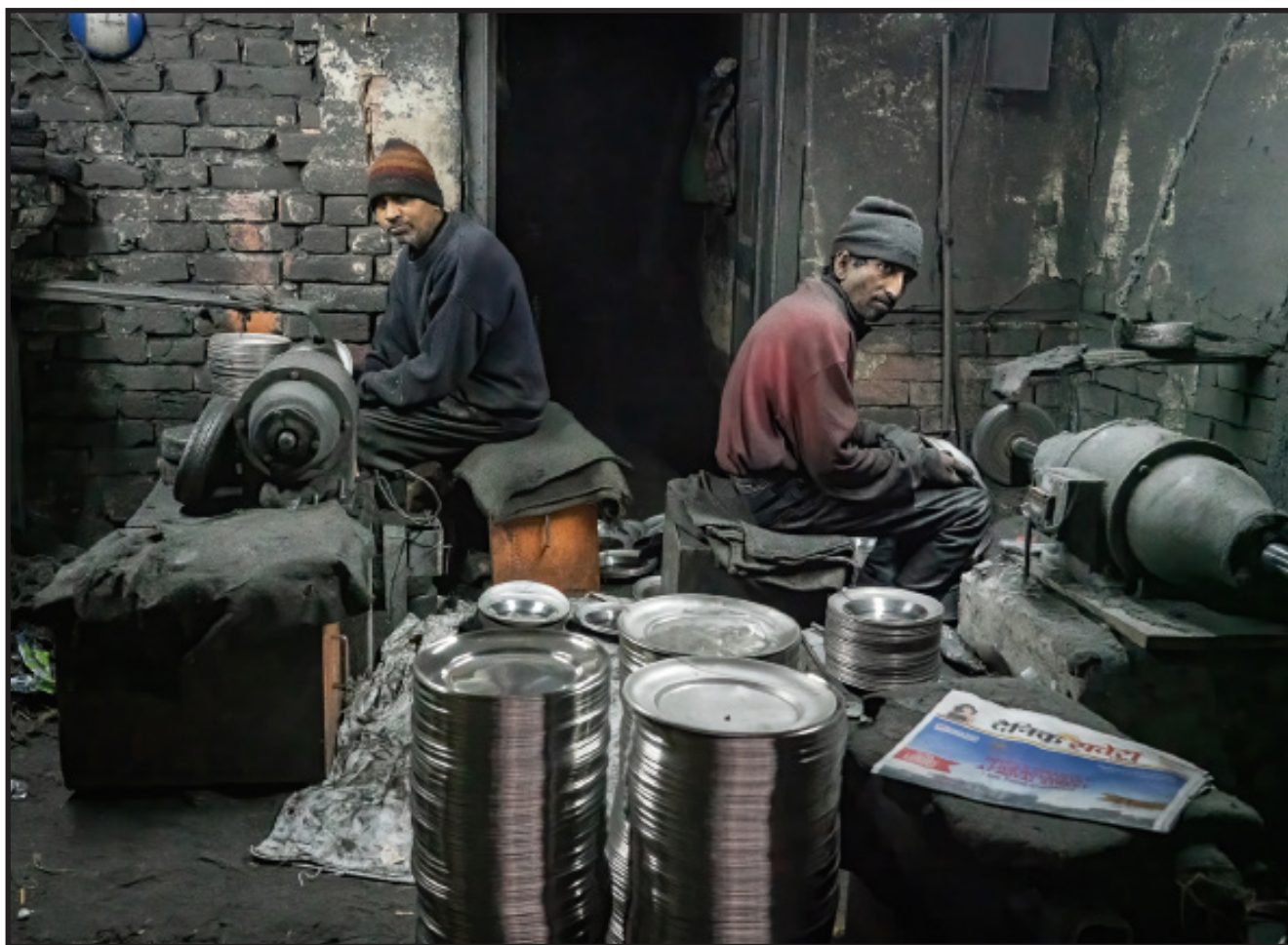
SEPTEMBER TRAVEL IMAGE OF THE NIGHT “Golden Temple Plate Makers, Amritsar India” by Don Goldman

Volume 82 Number 10 * October 2019 * www.sierracameraclub.com