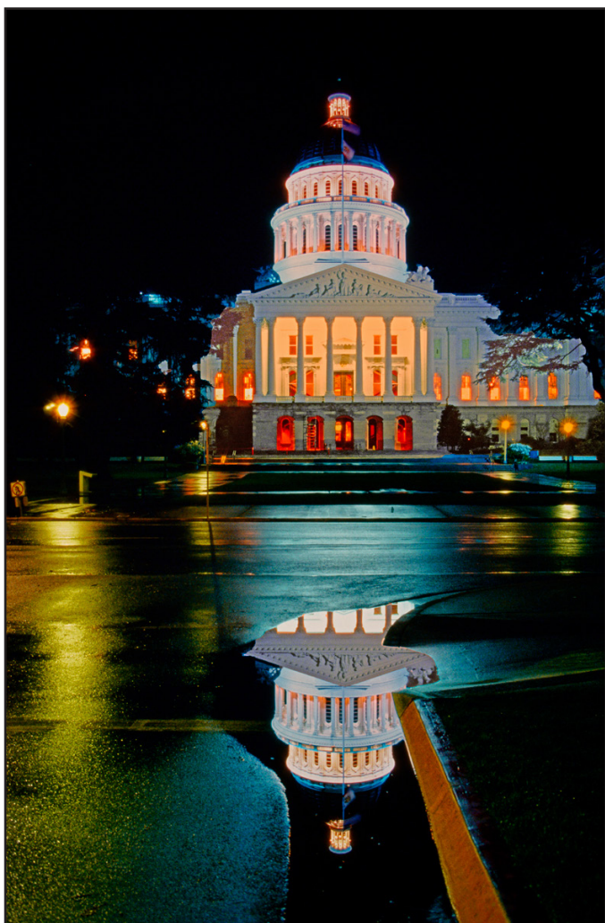
“CA State Capitol”