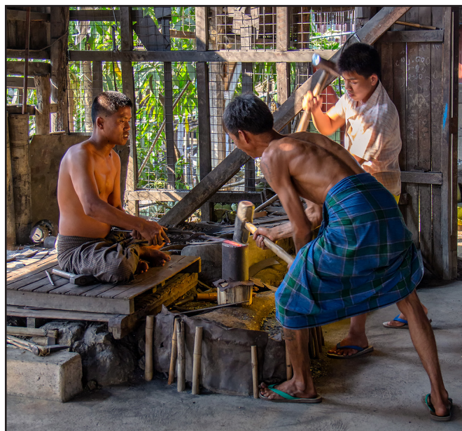
“Myanmar Foundry”