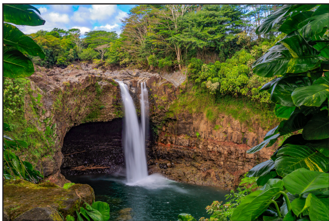
“Rainbow Falls Hilo Hawaii”