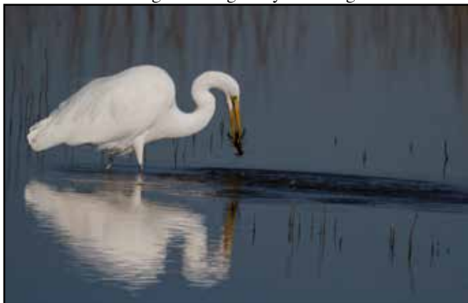
“Great Egret with Catch”