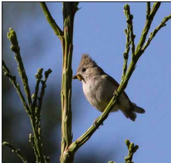
“Titmouse with Breakfast for the Kids” by Mel Wright