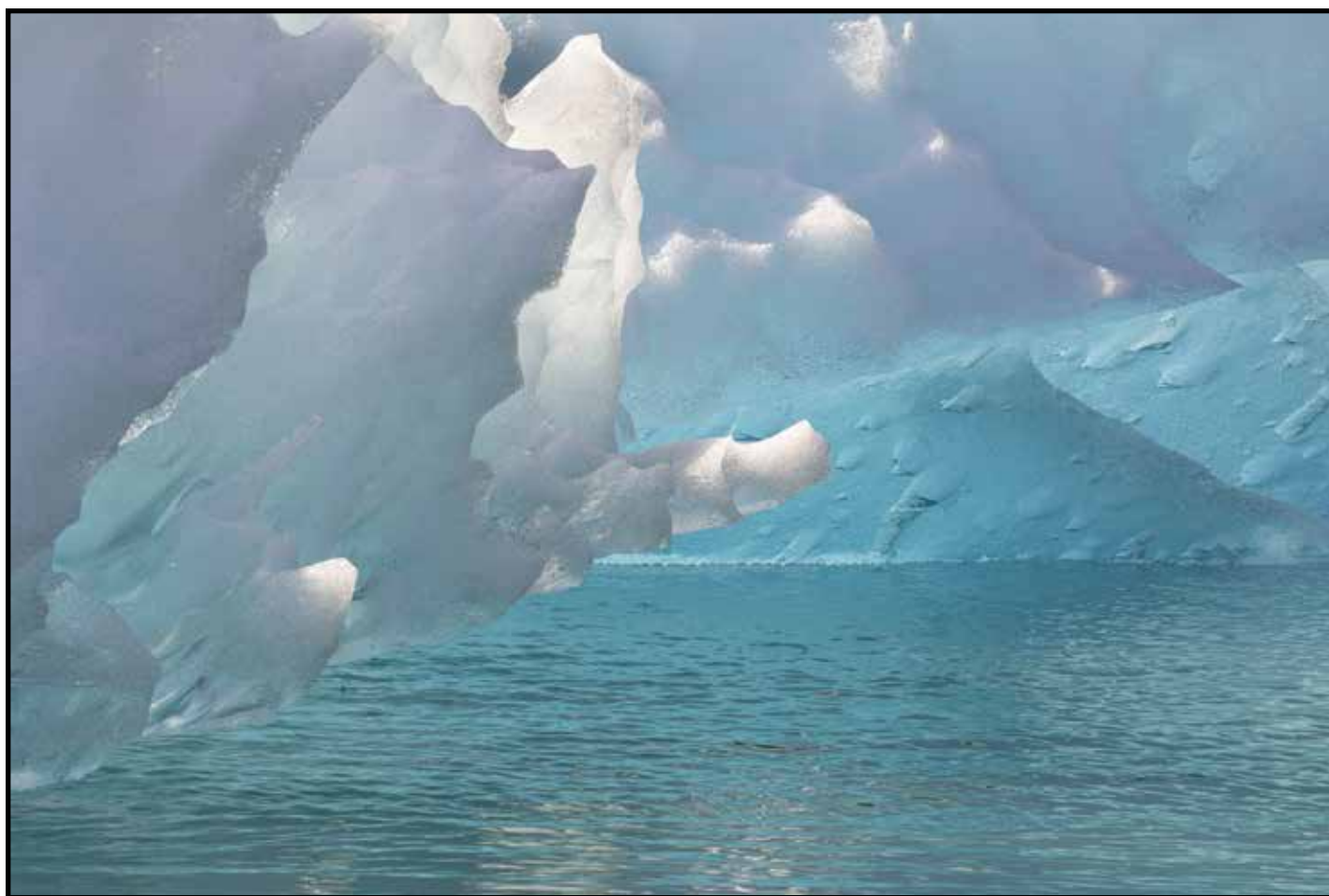
Nature Image of the Night "Ice Flow Sawyer Glacier, Alaska" by Jim Berger

Volume 81 Number 9 * September 2018 * www.sierracameraclub.com