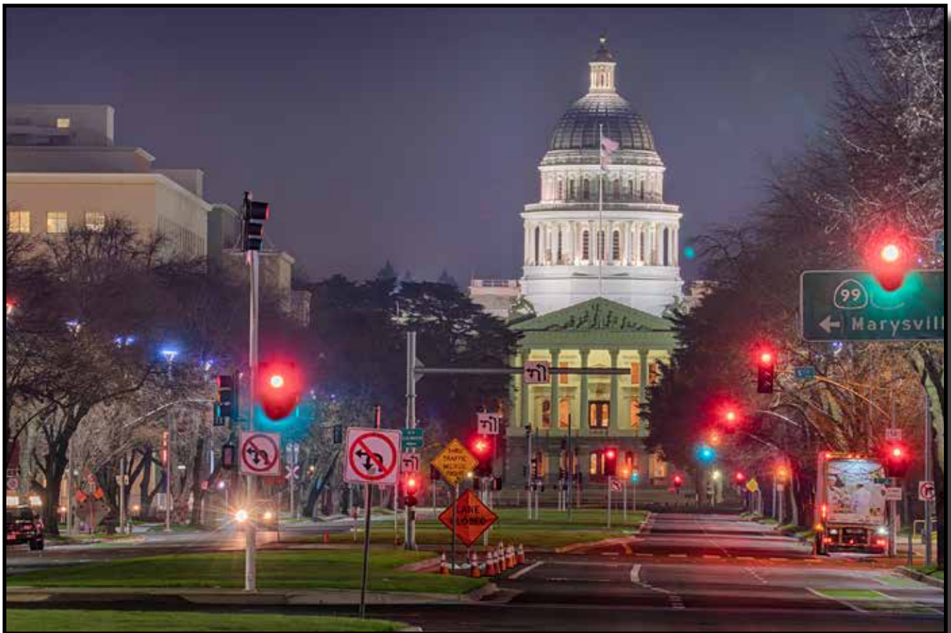
Color Print Category “The Capitol at 4 AM” by Gary Cawood