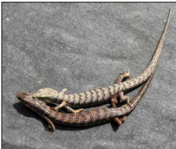
“Get Off My Rock”