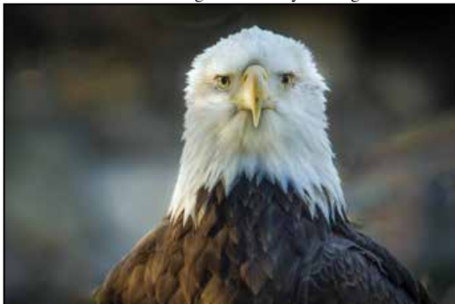
“Young Bald Eagle”