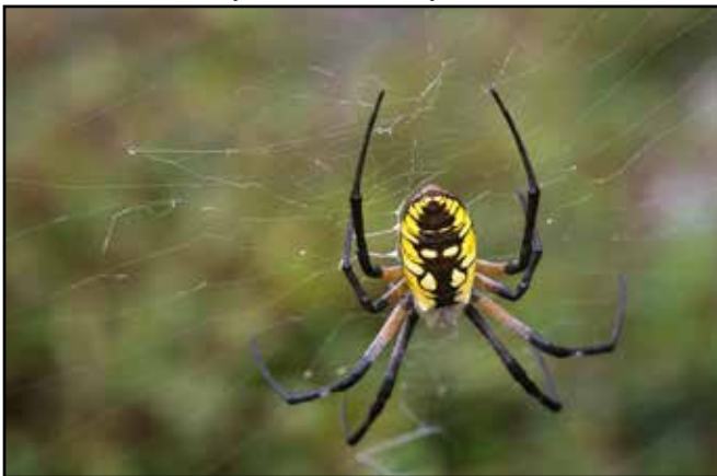
"Industrious Black and Yellow Garden Spider" by Anne Sandler