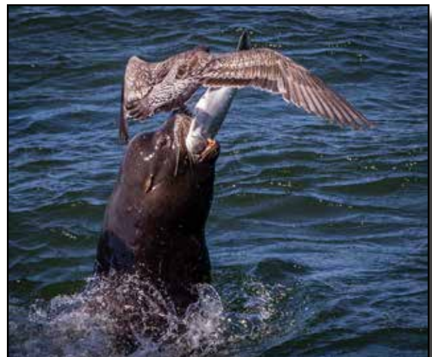
“Juvenile Gull Wants a Piece of Sea Lion's Salmon”