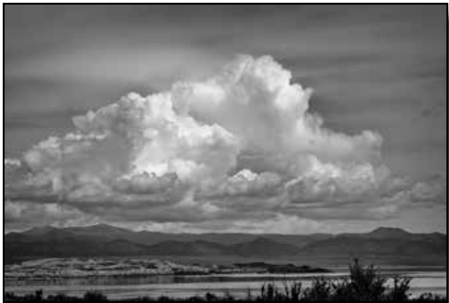
"Clouds over Mono Lake" by Lucille van Ommering