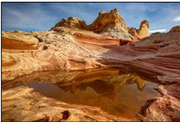
“White Pocket Reflection “ By Charlie Willard