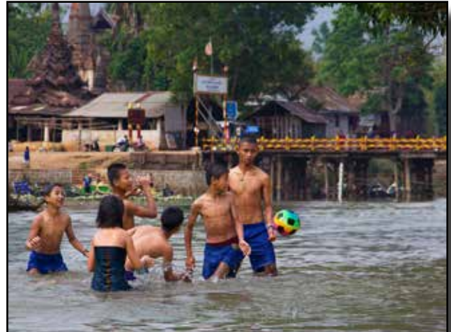
“Myanmar Water Polo “ By Gary Cawood