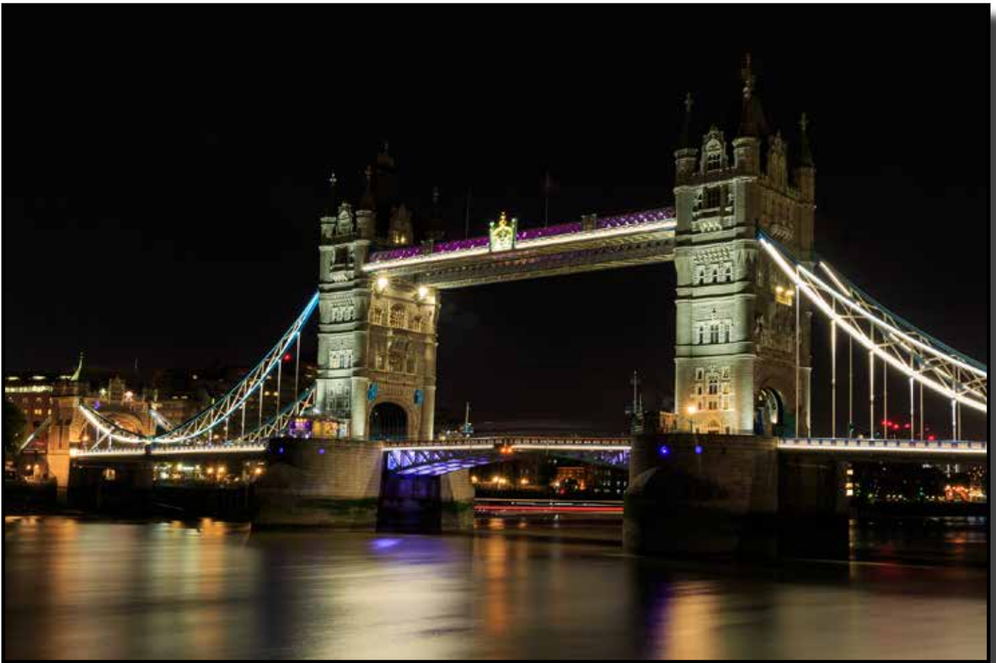
Travel Image of the Night "Tower Bridge, London" by Doug Arnold

Volume 81 Number 10 * October 2018 * www.sierracameraclub.com