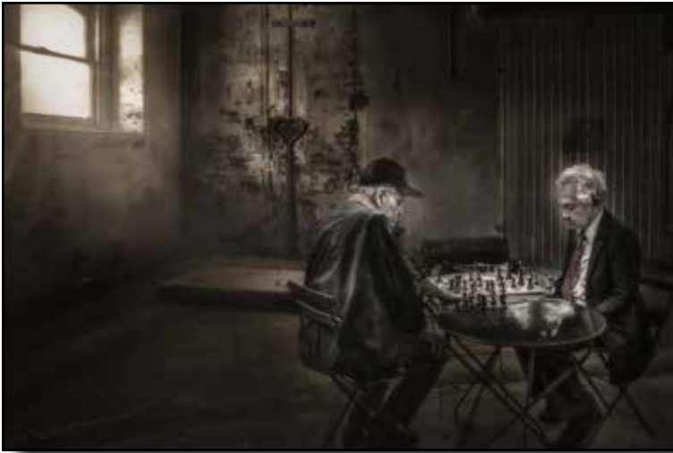
Image of the Night, Creative “The Prisoner’s Last Request” by Lucille van