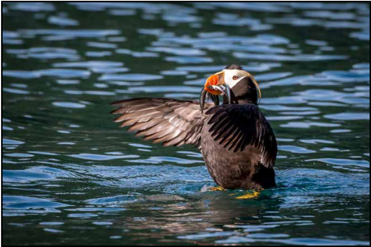
Nature Image of the Night "Tufted Puffin with Fresh Catch" by Jan Lightfoot

Volume 81 Number 11 * November 2018 * www.sierracameraclub.com