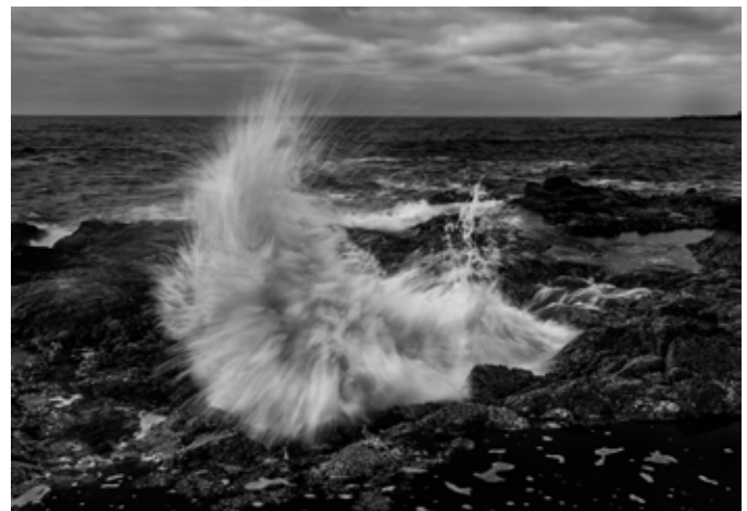
“Wave Crashing out of Thor’s Well”