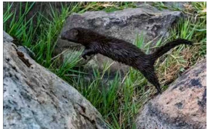
“American Mink Jumping”