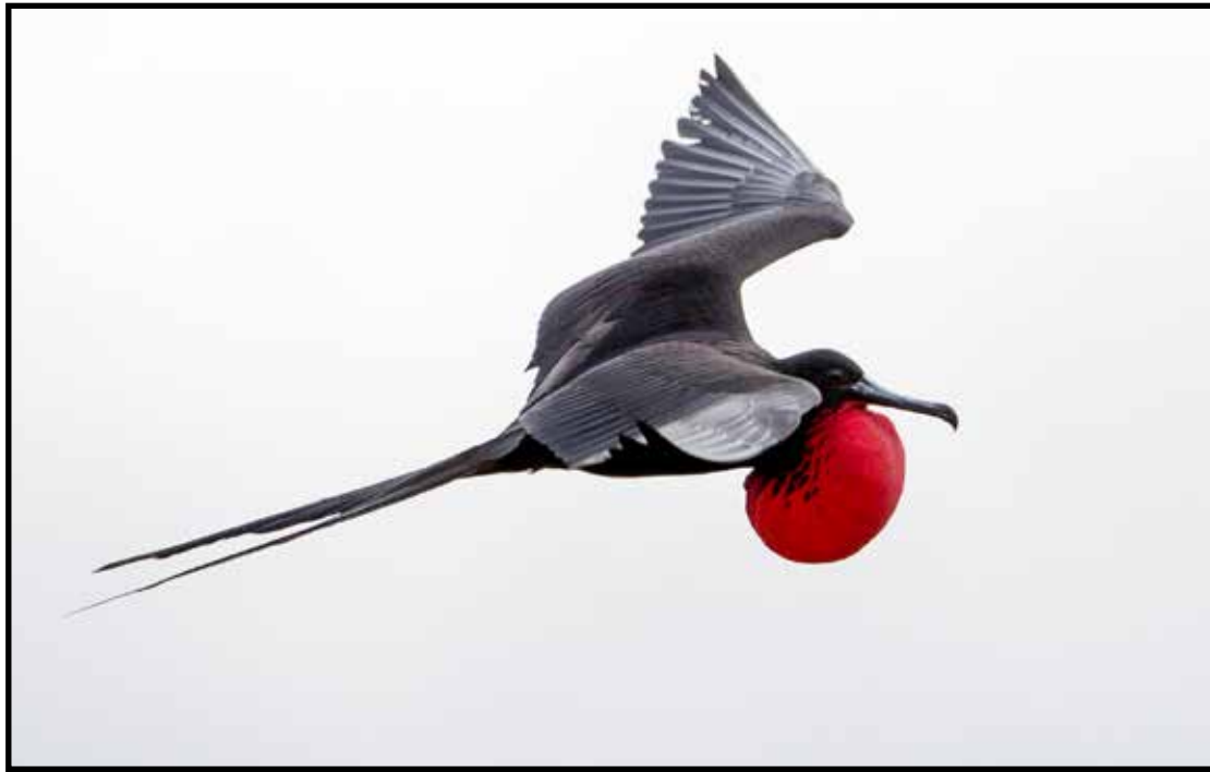
“Male Frigate Flies to Attract Females”