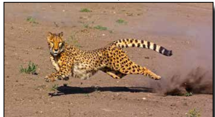
“Flying Cheetah” By Julius Kovatch