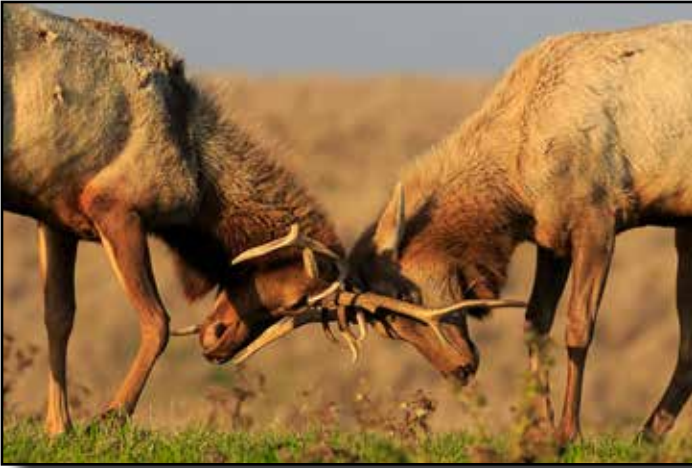
“Bull Elk Going Head to Head”