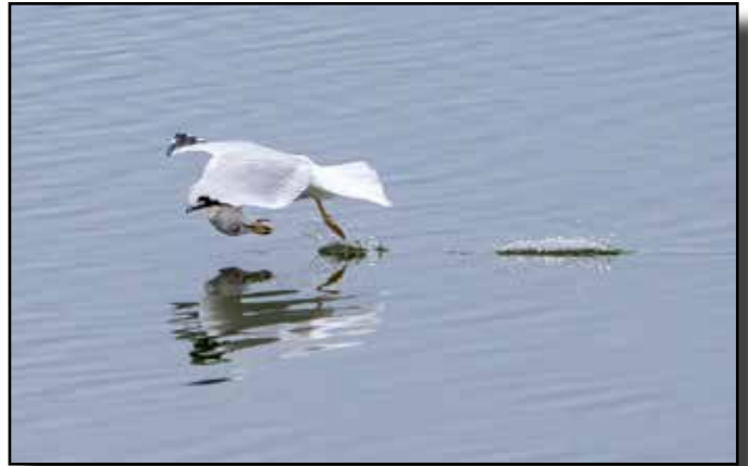
“Ring Billed Seagull Catching Small Fish” By Jan Lightfoot