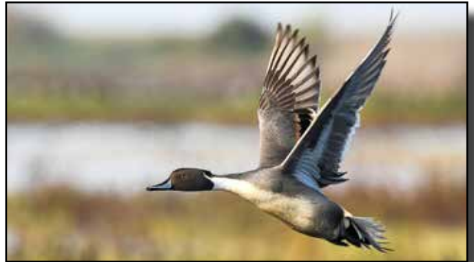
“Northern Pintail Accelerating” By Werner Krueger