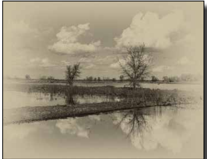
“Mystic Pond” By Ed Lindquist