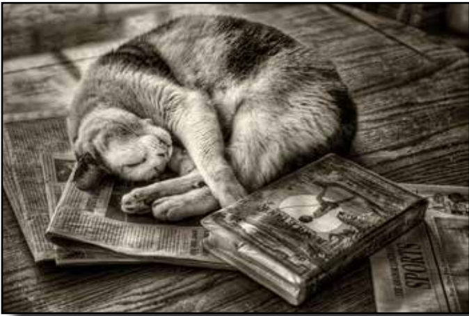
“Jungle Dreams” By Lucille van Ommering