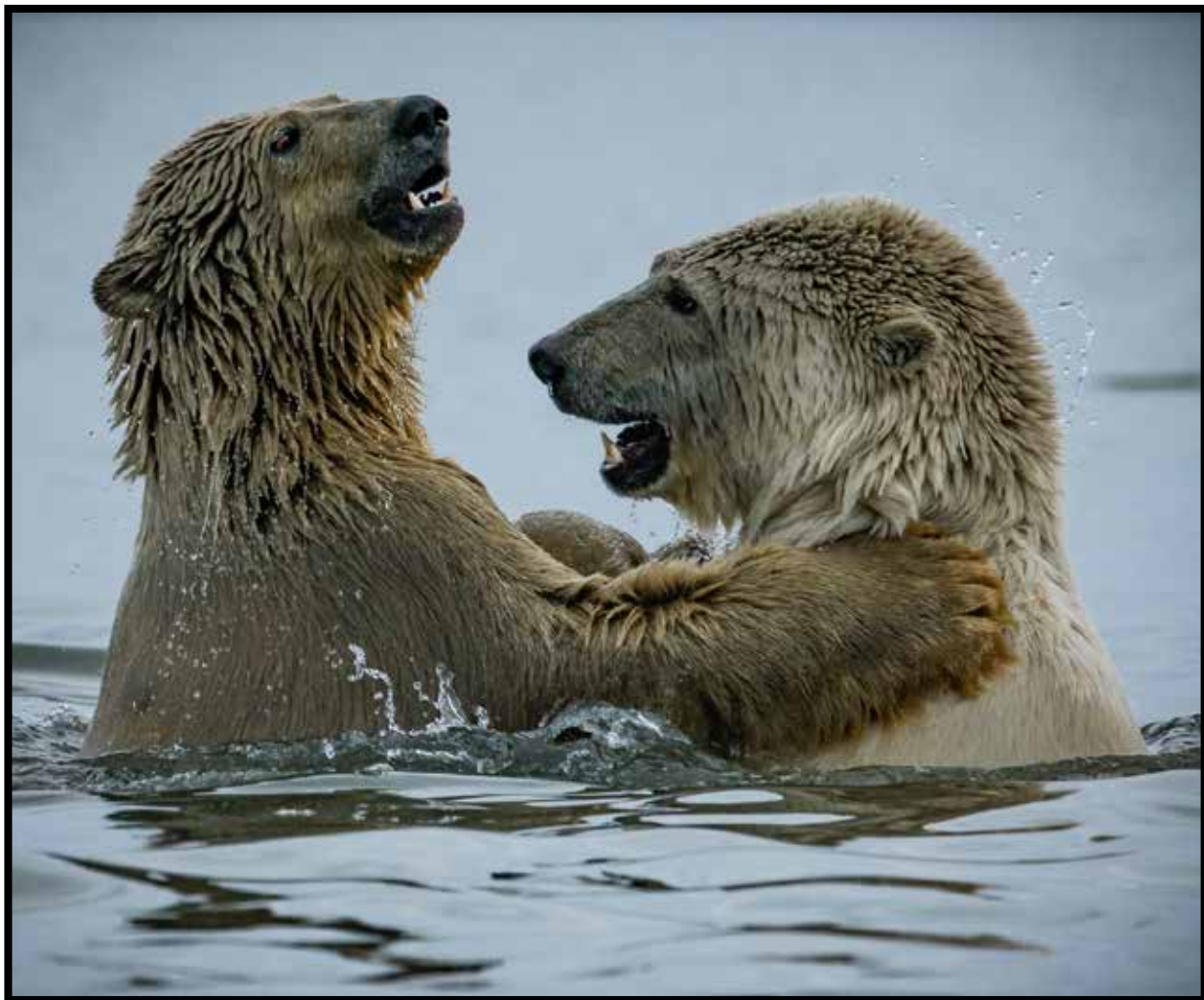
Nature Image of the Night "Playful Polar Bears Barter Island Alaska" By Don Goldman

Volume 81 Number 3 * March 2018 * www.sierracameraclub.com