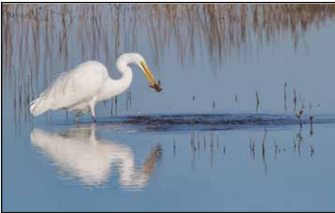
“Great White Egret with Lunch” By Gary Cawood