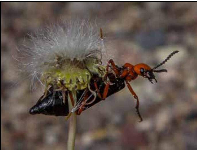
“Desert Blister Beetle Death Valley”