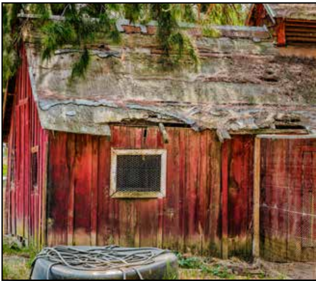
“Chicken Coop Cell Block.” By Lucille van Ommering

Image of the Night Color Category “City Transit Portland” by Jeannie O’Brien