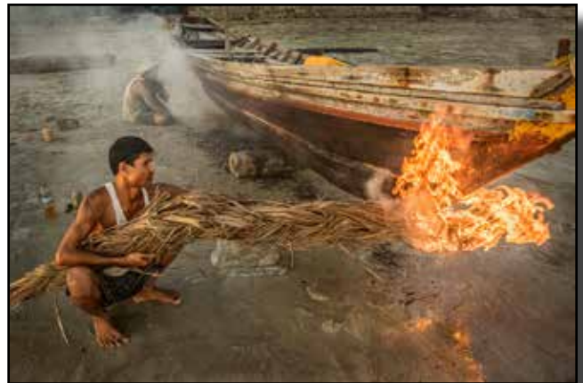
“Boat Repair, Myanmar”