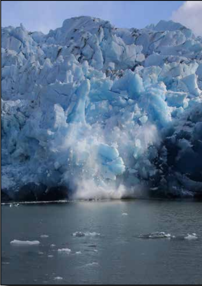
“Ice Calving Glacier Grey, Tdel Paine Chile” By Mel Wright