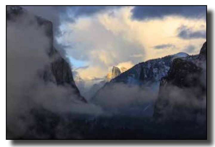
"Sun Kissed Half Dome"