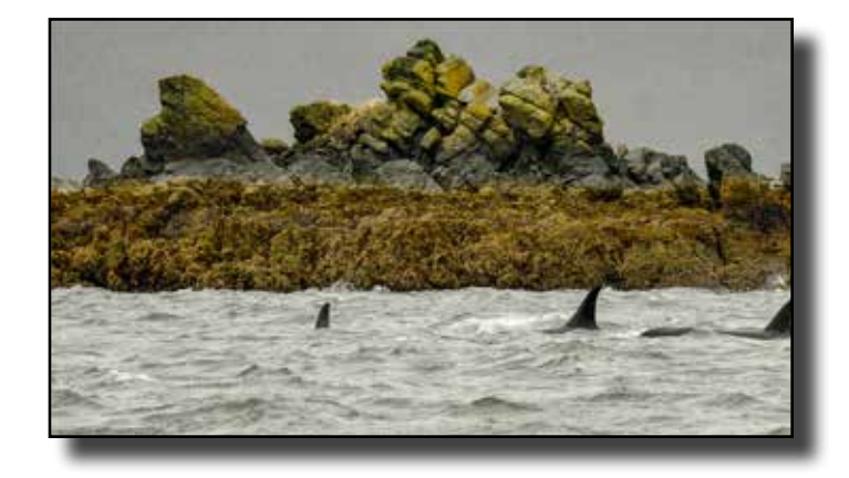
"Killer Whales Auke Bay"