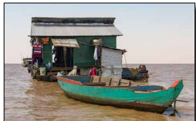
HM Gary Cawood Lake Inley, Myanmar, Floating Home