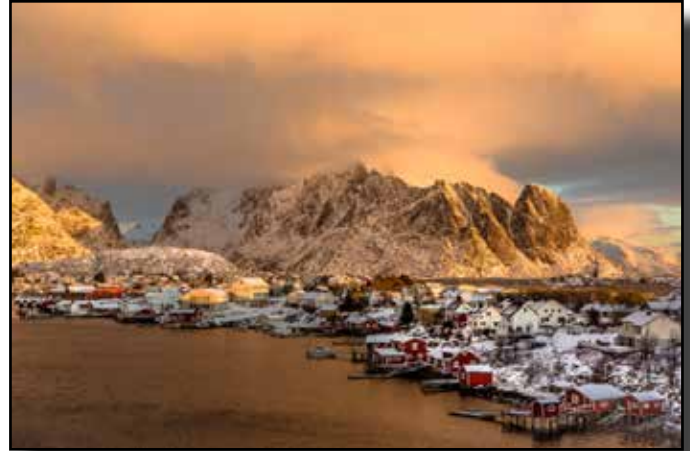
2nd Jim Berger Rundkuten Norway