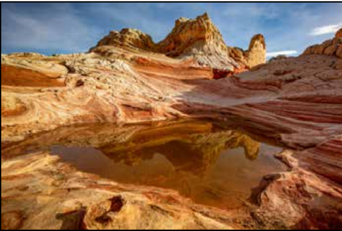
3rd Charlie Willard, White Pocket