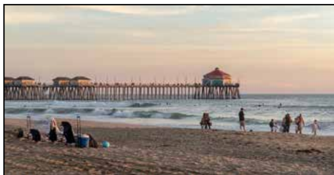
HM Gary Cawood, Sunday Sunset at Huntington Beach Pier