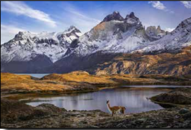
1st Jam Lightfoot Guanaco in Early Morning Torres Del Paine