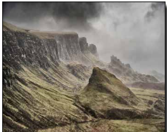
HM Joe Finkleman, Isle of Skye