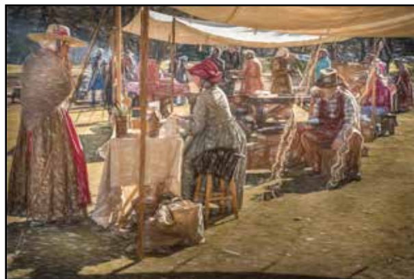
HM Jim Berger, Frontier Picnic