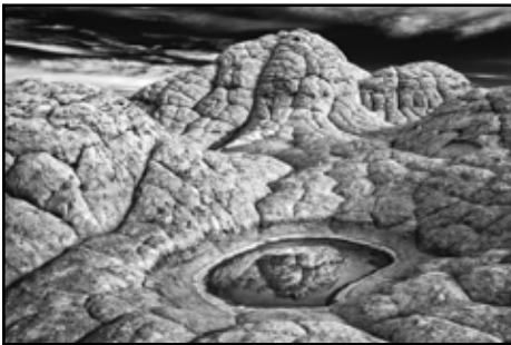
1st Charlie Willard White Pocket Reflection