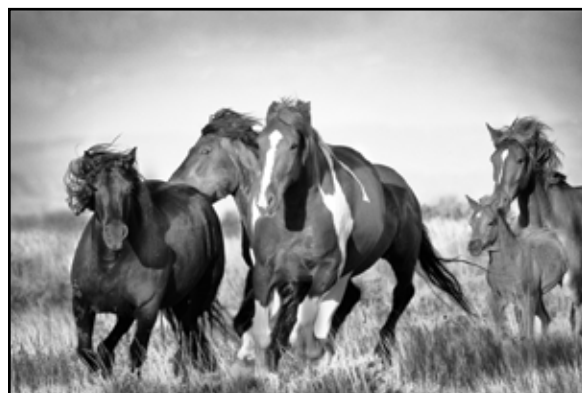
HM Jim Berger, Wild Horse Stampede Wyoming