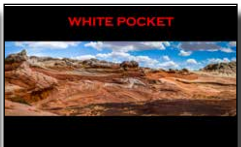
HM Charlie Willard, White Pocket