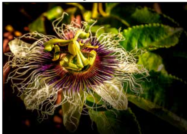
HM Gary Cawood, Passion Flower on Steroids