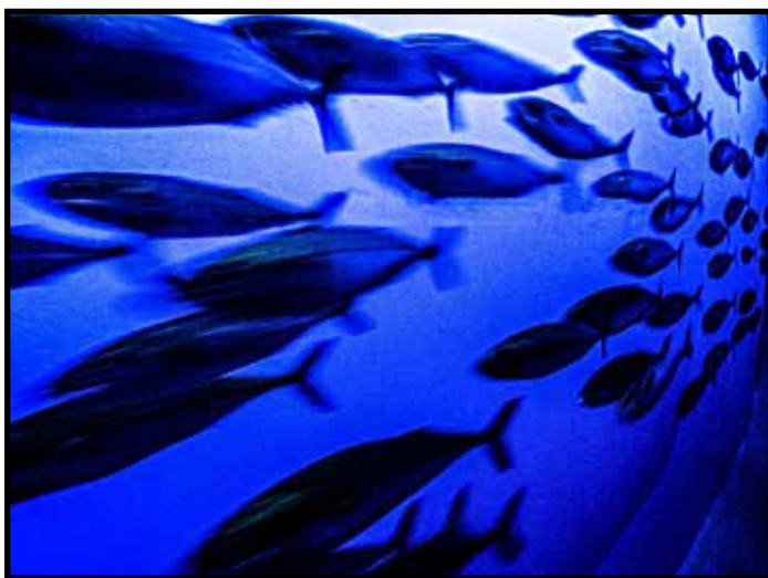
General, Creative Image of the Night "Blue Mackerel" by Irene Berger

Volume 82 Number 2 * February 2019 * www.sierracameraclub.com