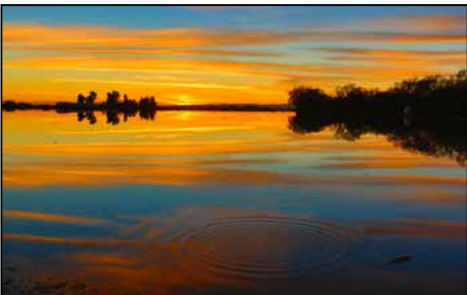
“Glorious Reflection” by Truman Holtzclaw