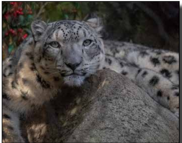
“Misha the Snow Leopard at Sacto Zoo”