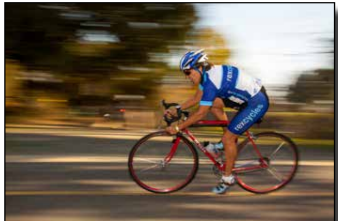
“Eleven Mile Mark American River Parkway”