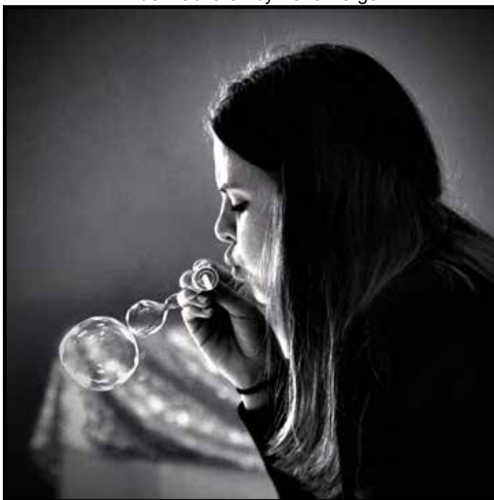
General, Open Image of the Night "Blowing Bubbles" by Jeanne Snyder