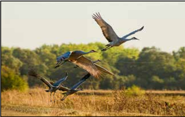
“Sandhill Cranes Ascending Near Desmond Road” by Werner Krueger