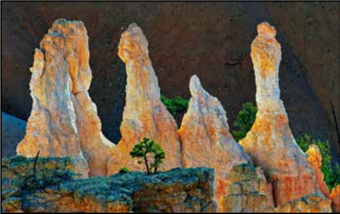
“Bryce Hoodoos Early Morning” by Juilus Kovatch