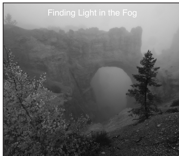
Finding Light in the Fog

"Kumbh Mela Celebration Alahabad India" by Don Goldman