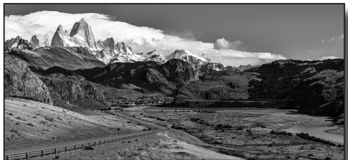
“Mt Fitzroy and El Chalten Argentina” by Pat Honeycutt