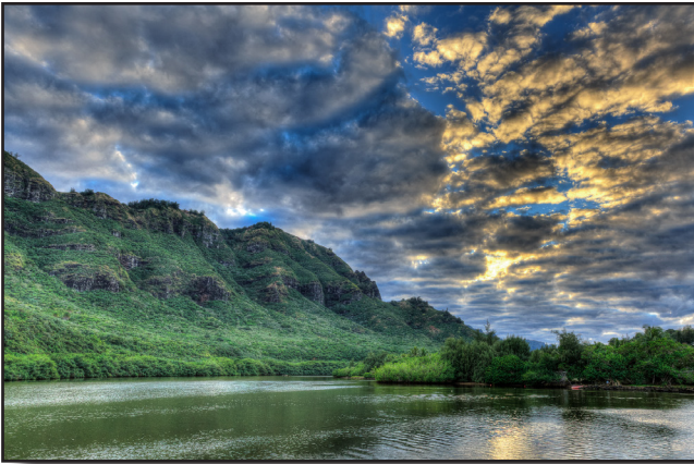
“Poipu Kauai”