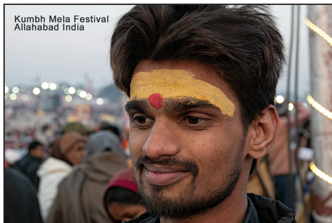
Kumbh Mela Festival Allahabad India