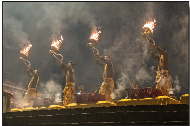
“Aarti Festival Varanasi India” by Don Goldman