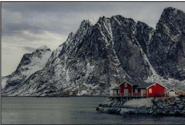
“Vestlofoten Norway” by Jim Berger