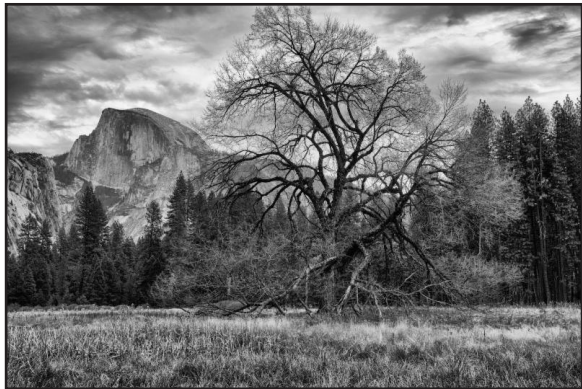
Ahwahnee Meadow

Tickets are just $15 per person, drawing tickets are $5 each or 5 for $20. viewpointgallery.org