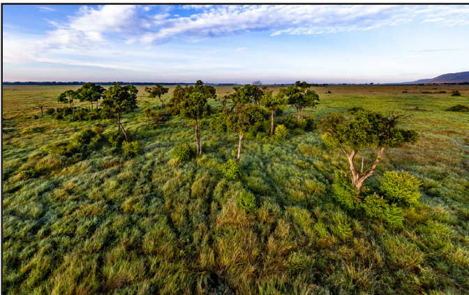
“Morning View of the Maasai Mara from Balloon Ride”