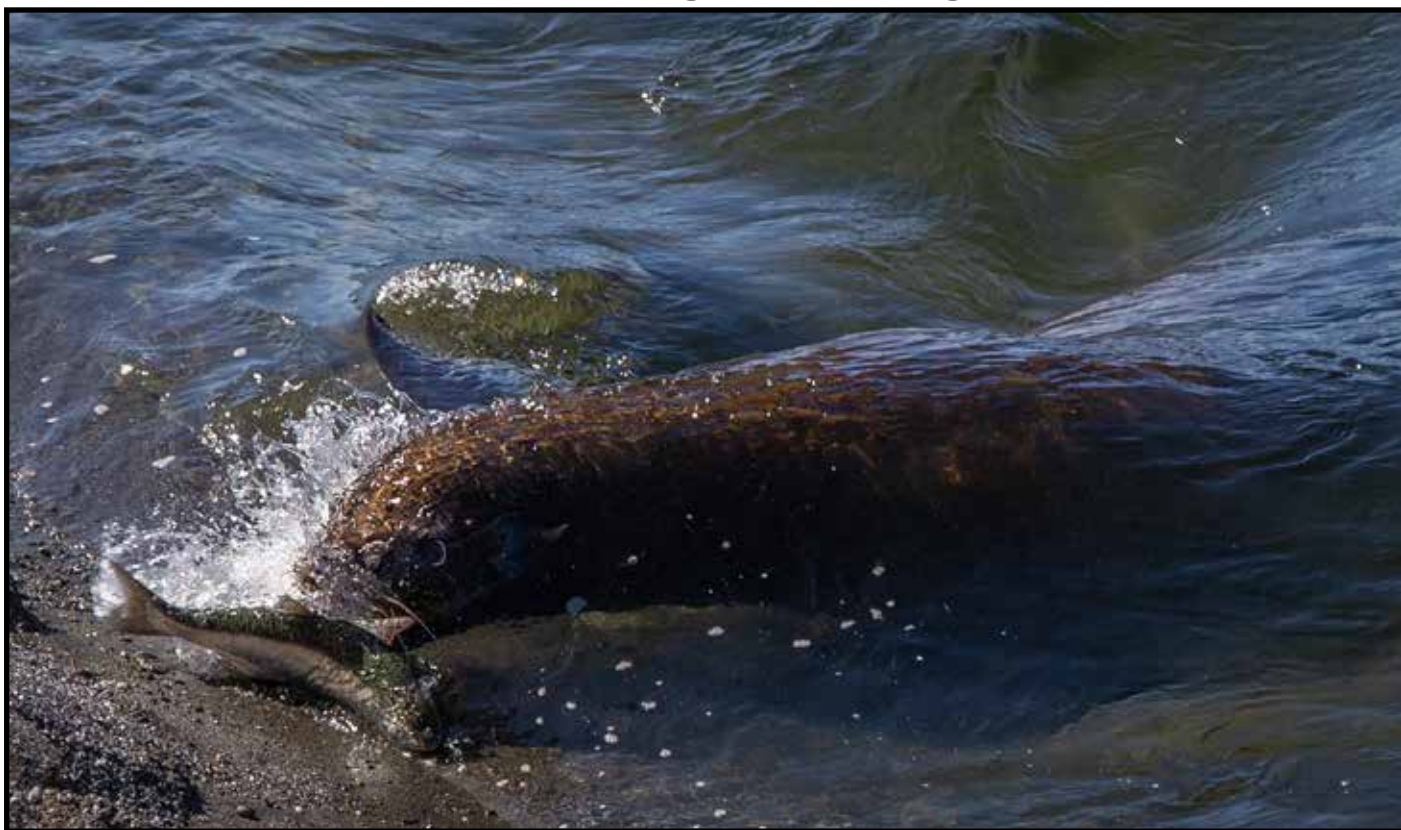
“Sea Lion Chasing Salmon onto Beach” by Kristian Leide-Lynch