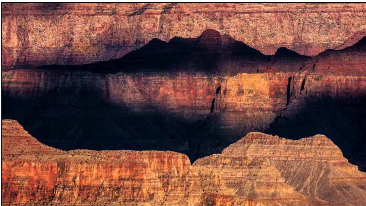
Color Print of the Night “The Grand Illusion of Light” by Jan Lightfoot