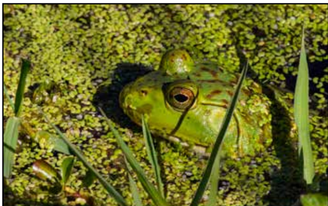
“Bullfrog In Duck Weed” by Truman Holtzclaw