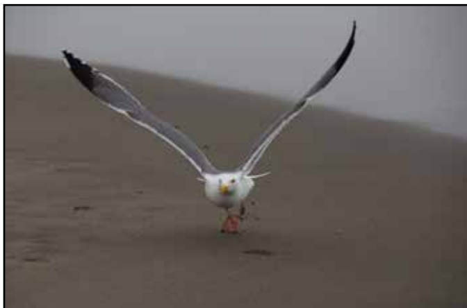
“Common American Gull taking off Bodega Bay”