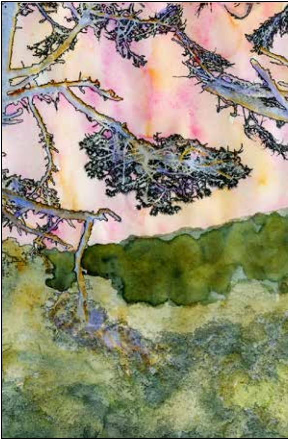
“Point Reyes” by Joseph Finkleman