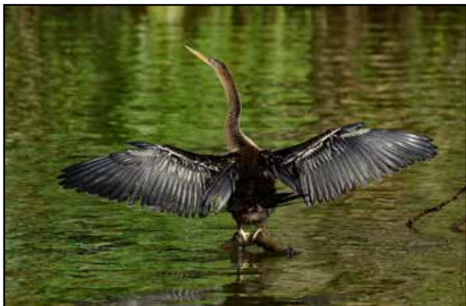
“Anhinga Drying Wings Costa Rica”