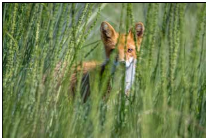
“Red Fox Watching Through Grasses” by Jan Lightfoot