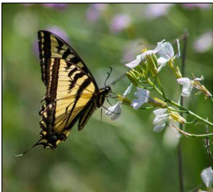
“Swallow Tail Butterfly Eating Nectar” by Laura Berard