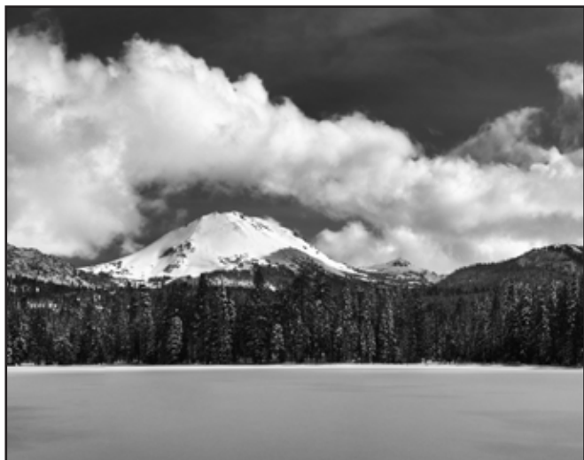
“Lassen Peak Through the Clouds” By Aaron Vizzini