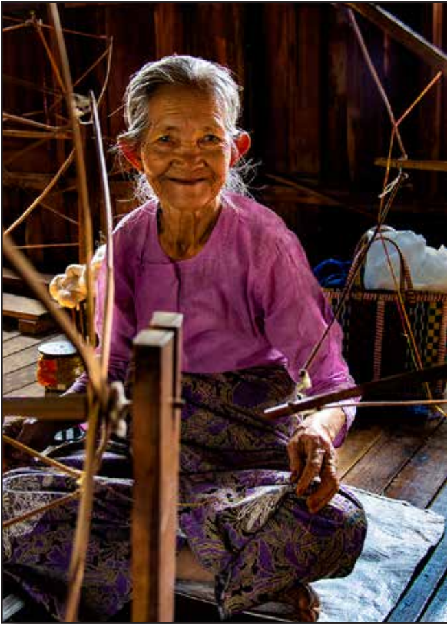
“Yarn Spinner at Lake Inle, Myanmar” By Gary Cawood