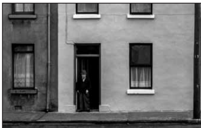
“Lonely Old Irish Man in Limerick”