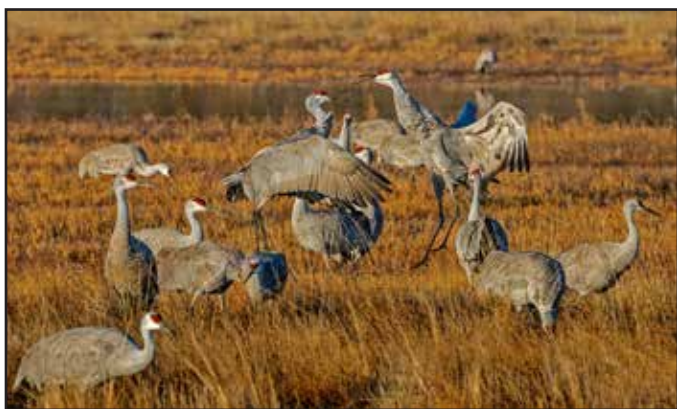
“Sandhill Cranes Fighting” By Julius Kovatch