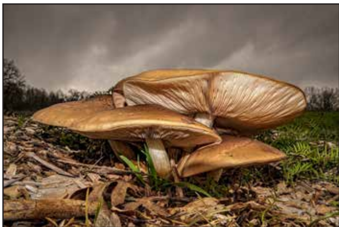
“Magnificent Mushrooms” By Don Goldman