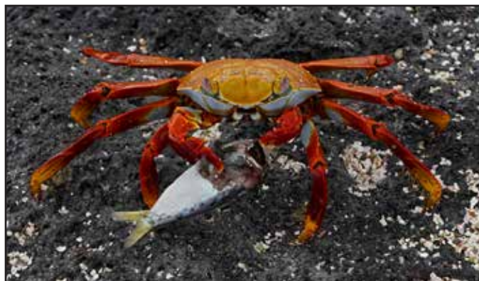
“Sally Lightfoot Crab & Flesh Flies Enjoy Meal Rich in Omega-3s”