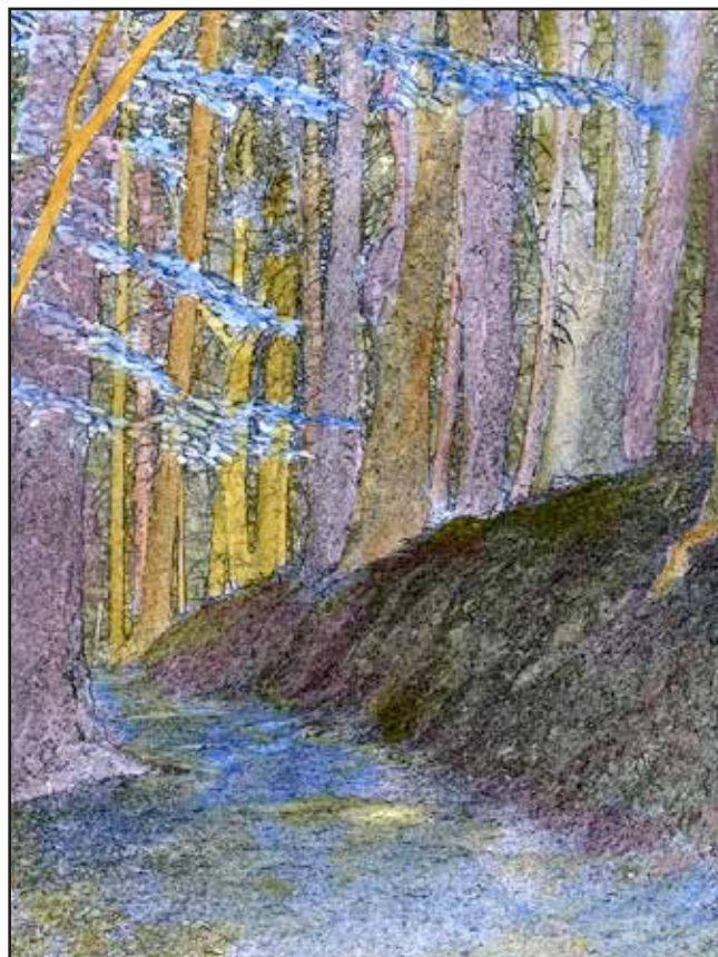
“Pt Reyes” By Joseph Finkleman