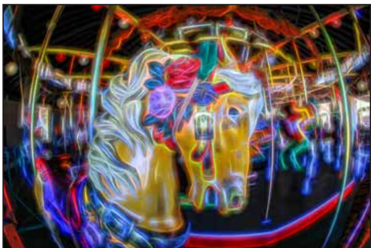
“Electric Number 2” By Jim Berger