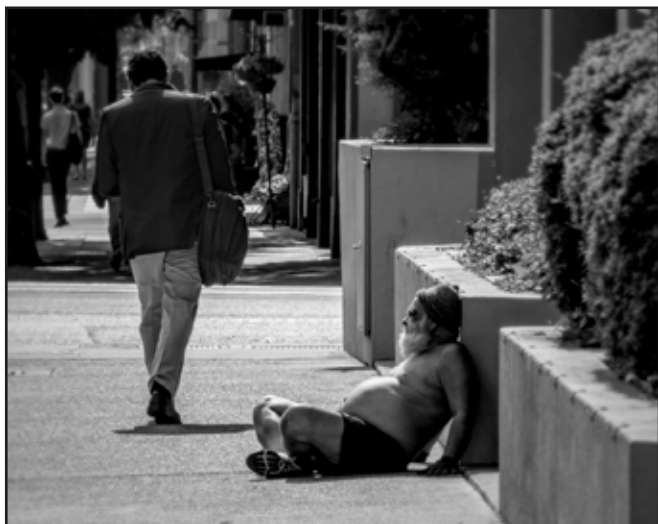
“Nobody Notices Nobody” By Gary Cawood