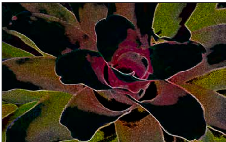
“Cactus Flower” By Gay Kent